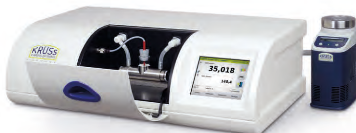
P8000-T with circulation thermostat PT31

When used in combination with polarimeters, the PT80 or PT31 circulation thermostats ensure uniform temperature control of the samples to be measured. This enables high-precision and reproducible measurements, such as those prescribed by different standards in the pharmaceutical industry at 20 °C or 25 °C. Water-temperable measuring tubes from all manufacturers can be temperature-controlled with our circulation thermostats and are connected in no time at all using the quick couplings for hoses integrated in our polarimeters.