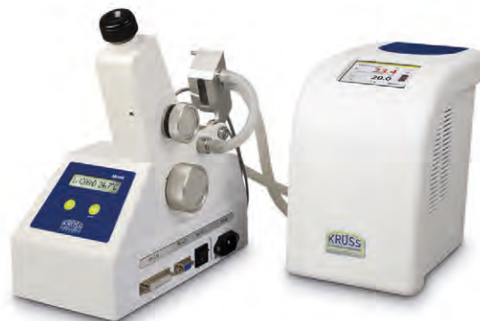
AR2008 with circulation thermostat PT80

The PT80 and PT31 circulation thermostats are often used for the sample temperature control of refractometers, whereby the temperature control of Abbe refractometers is particularly popular. Abbe refractometers can therefore achieve highly accurate and extremely reproducible measurement results completely independent of the ambient temperatures. The more powerful PT80 guarantees fast and stable temperature control of the measurement sample even in laboratories without air-conditioning. Both circulation thermostats are extremely small and can be very easily connected to all water-temperable refractometers.