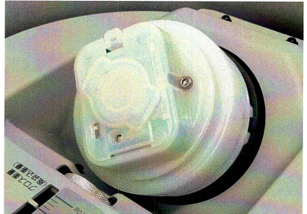
The picture taken with ARV-310