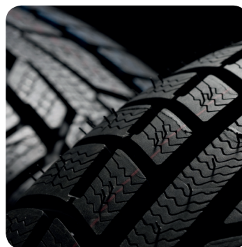
the minispec Cross Link Density Analysis