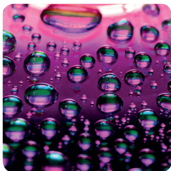
the minispec Droplet Size Analysis